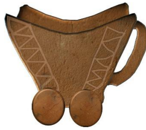
Fig. 3. Reconstruction of an old toy.

This example shows that it was necessary to transform the vertical axis into a horizontal axis. In other words, it was necessary to adapt a characteristic (the vertical axis became horizontal) and therefore it is a Creativity of Order 1 as it is shown in Fig. 4.