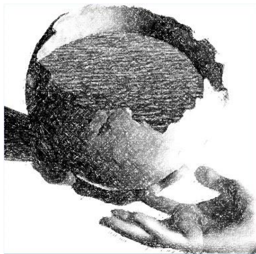
Fig. 2. Skull whose characterization is concavity.

Using a skull for the first time as a bowl to hold water is an example of CO0. From the observation of Figs. 1 and 2, it can be clearly seen that the pairing of the characteristic concavity in both figures gives rise to the creative act of using the skull as a water-containing bowl.