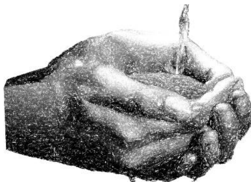
Fig. 1. Two hands together whose characterization is concavity.

An example of characterization is presented in Fig. 1. The human being used his own hands as a liquid container object. Fig. 1 shows how, by joining the two hands, they can be used to contain, among other things, water. Thanks to the concavity they create when they are together. The characterization in this case is precisely the concavity.